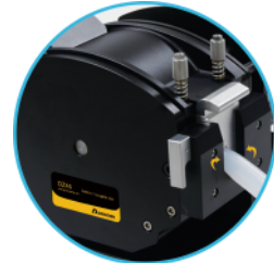
DZ45-II continuous tubing