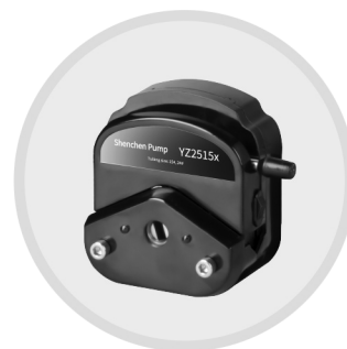
EasyPump Pump Head